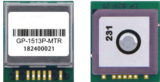
Figure1: GP-1513P-MTR Top View